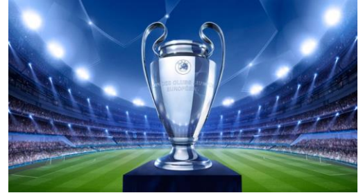
Qualify your company for the Champions League!

Those companies that recognized this are playing in the Champions League. They are also willing to invest a decent amount in the best coaches because they know that success will pay off. All others will continue climbing up and down within their league and complaining about cost and time pressure, "daily firefighting" and major margin losses, without ever getting back their investment in in the IRIS certificate.